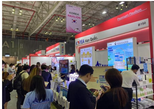
Cosmobeaute Vietnam 2023