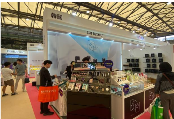
China Beauty Expo 2023