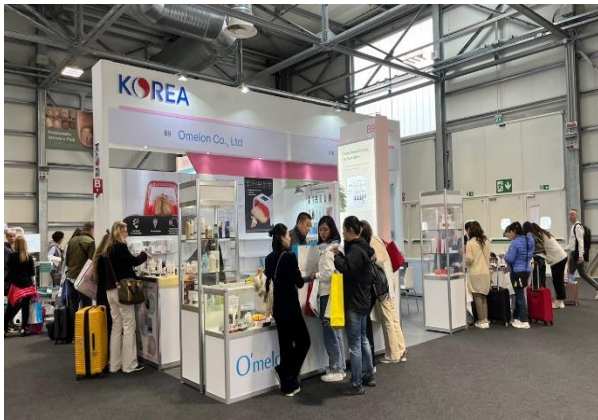
Cosmoprof Bologna 2023