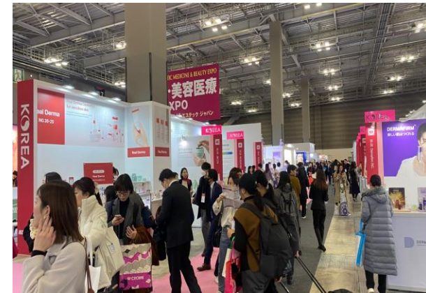
Cosme Tokyo & Tech 2024