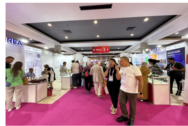
Beauty Istanbul 2023